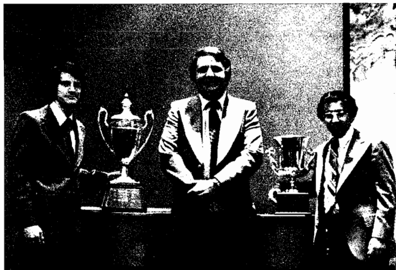
1978 Champions, Northwestern University